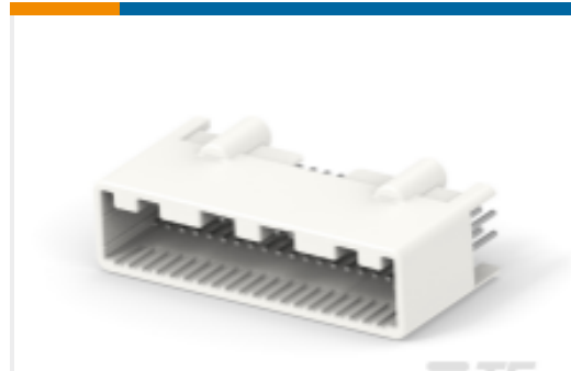
TE Part #2209908-1 025 40POSTION CAP ASSY(V-TYPE)