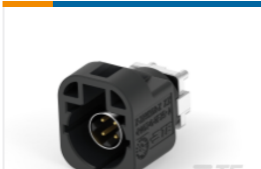
TE Part #2291364-1 4POS, PIN DIA 0.6, HEADER ASSY, CODE A