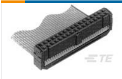
TE Part #1658622-1 10 NOVO MIL/CTR 30DP, LEAD FREE