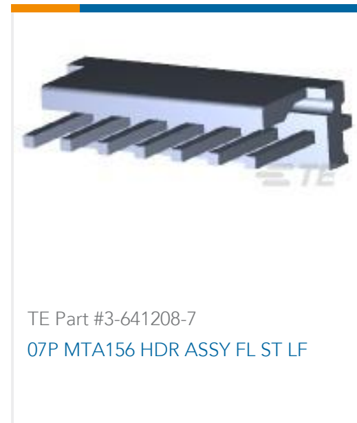
TE Part #3-641208-7 07P MTA156 HDR ASSY FL ST LF