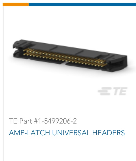
TE Part #1-5499206-2 AMP-LATCH UNIVERSAL HEADERS