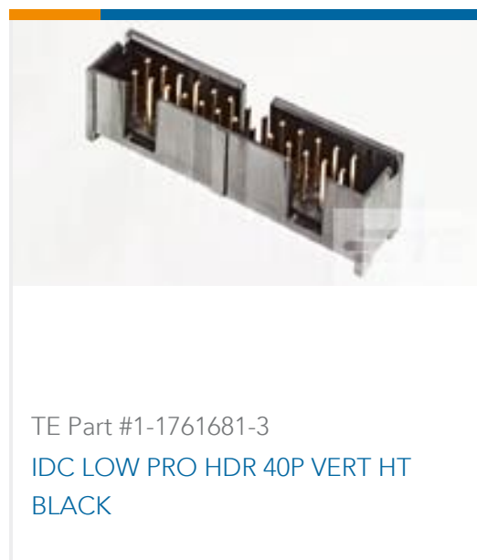
TE Part #1-1761681-3 IDC LOW PRO HDR 40P VERT HT BLACK