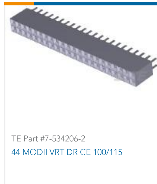
TE Part #7-534206-2 44 MODII VRT DR CE 100/115