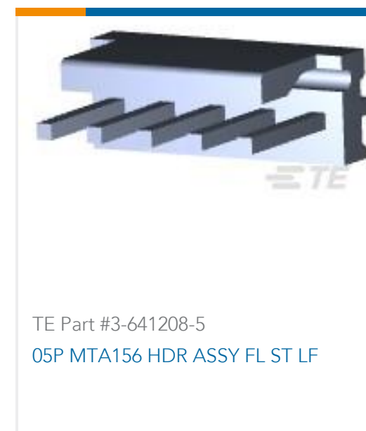
TE Part #3-641208-5 05P MTA156 HDR ASSY FL ST LF