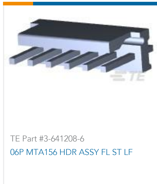
TE Part #3-641208-6 06P MTA156 HDR ASSY FL ST LF