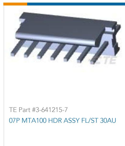
TE Part #3-641215-7 07P MTA100 HDR ASSY FL/ST 30AU