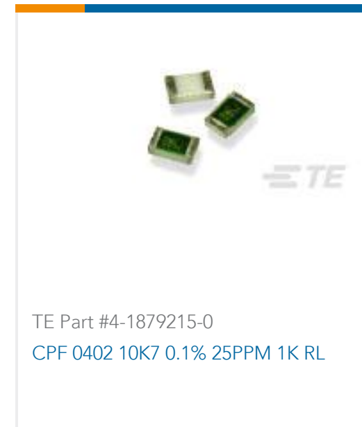
TE Part #4-1879215-0 CPF 0402 10K7 0.1% 25PPM 1K RL