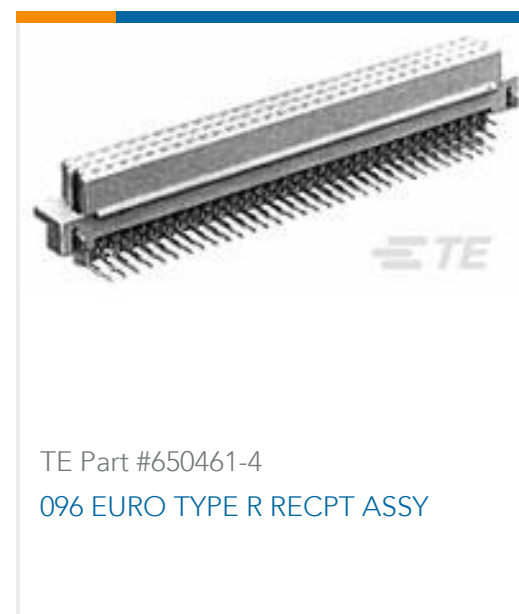
TE Part #650461-4 096 EURO TYPE R RECPT ASSY